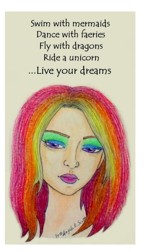
Live Your Dreams