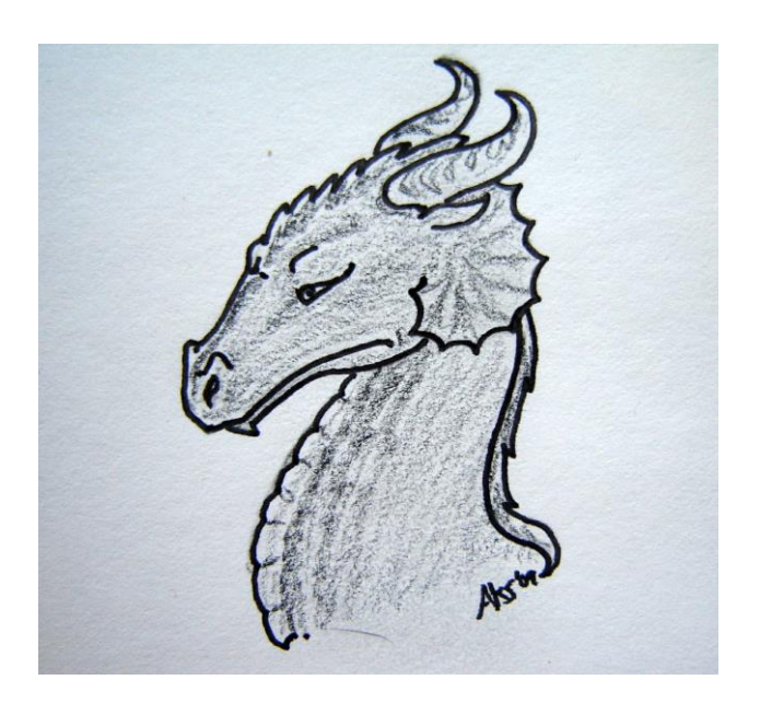
Dragon Bust 2